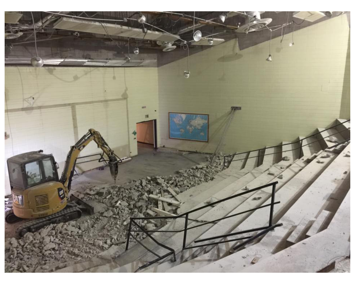
Renovation of the new space virtually unrecognizable

Unlike the room it replaced, the lab isn't being used for lecturing, though